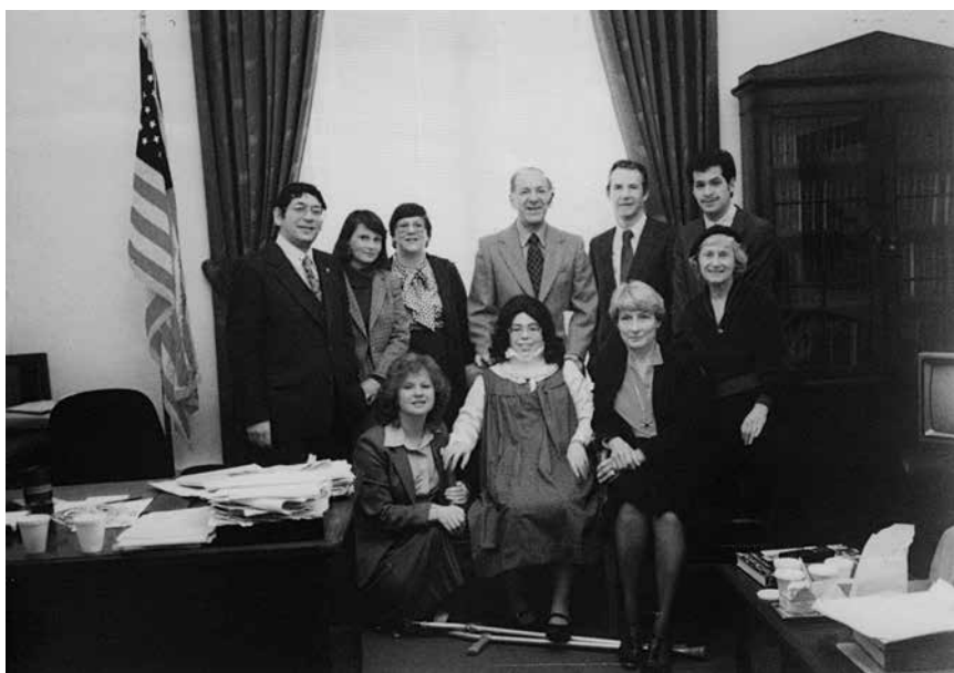
Photo taken just before Jack Klugman testified before Congress in 1982. The people are: