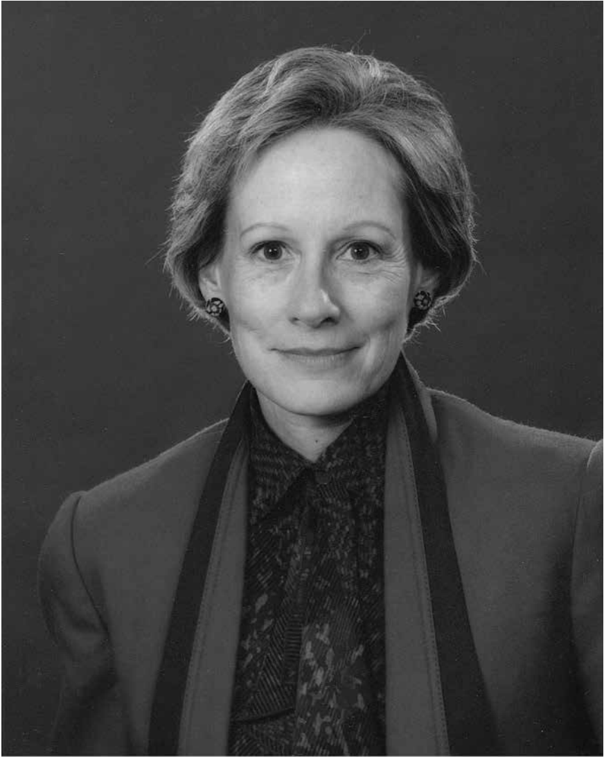
Senator Nancy Kassebaum (KS)

Photo of former Senator Nancy Kassebaum (Kansas), who was the Senate sponsor of the Orphan Drug Act. She agreed to sponsor the legislation when she was visited by a husband and wife who explained the importance of the legislation for families with rare diseases. The wife had Huntington's disease when they made that visit.