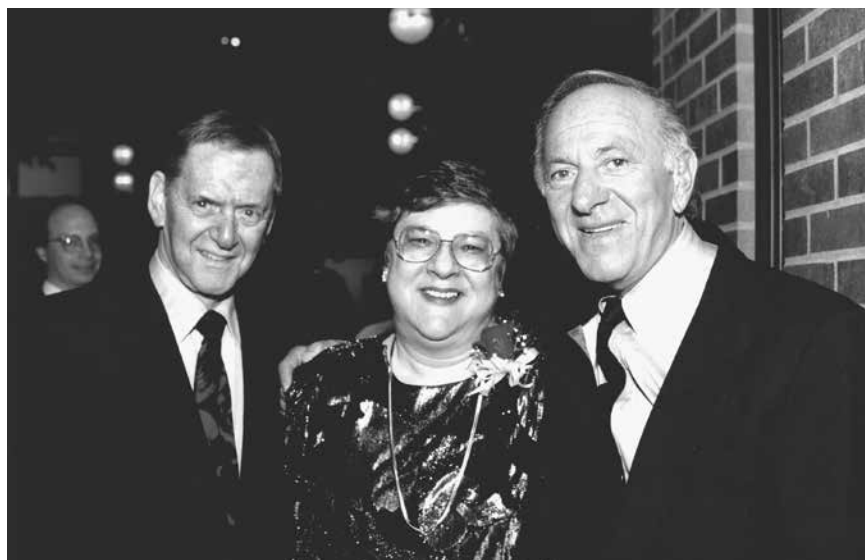
Celebrating the 10 th anniversary of the Orphan Drug Act in 1993, Jack Klugman (R) and Tony Randall (L) joined us in Washington DC. Jack and Tony co-starred in the popular TV comedy show "The Odd Couple" for several years in the 1990's, but it was Klugman's "Quincy, M.E." series in the 1980's that spurred enactment of the ODA.

In the years since the Quincy shows about orphan drugs, Jack Klugman suffered repeated bouts with throat cancer. The last time I saw him was when he came to our celebration of the Orphan Drug Act's 10th anniversary, in Washington DC, with his dear friend Tony Randall. The "Odd Couple" indeed!