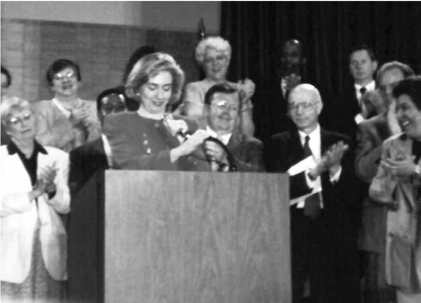
Photo was taken at a public event in Washington DC sometime between 1992 to 1995 when Hillary Clinton was trying to pass national health insurance legislation. Her enemies named it “HillaryCare” and succeeded in killing the legislation. I am standing 2 rows behind Hillary on a stepped platform.

In time I realized it was not so much the price of the drug that caused human misery, it was the fault of the American health care system. Even if we could afford health insurance, there was no guarantee that an insurance company would sell us a policy if we had a pre-existing condition. We needed mandatory, universal health insurance so no one would be denied the medicines they need to stay alive. The government and insurance companies should be arguing with drug manufacturers about prices, NOT the patients!